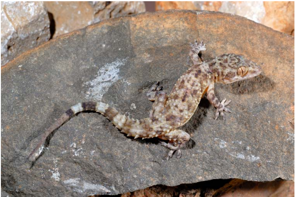
Fig. 3. Adult, Socotra, Dhero area, 29.XII.2007.