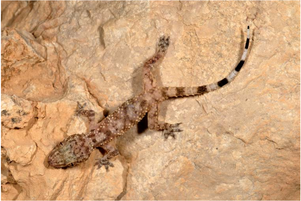
Fig. 2. Immature, Socotra, Temedeh env., 29.XII.2008.